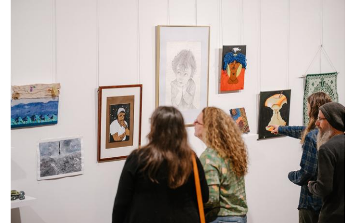
Opening night of GENESIS 2025

Stitched and bound is a biennial exhibition showcasing the innovative range of current work being produced by Western Australian artists who challenge the usual concept of the 'quilt' medium. Artists are encouraged to work outside the quilt format and push the boundaries of the medium focusing on making personal statements through the use of unconventional materials, ideas and techniques. Pieces to be exhibited are selected on artistic merit, innovation within the quilt medium and standard of design and execution.