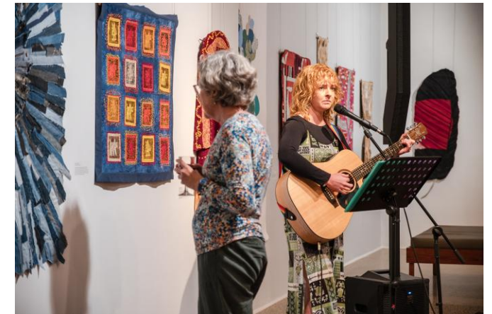
Opening night of stitched & bound 2024/25