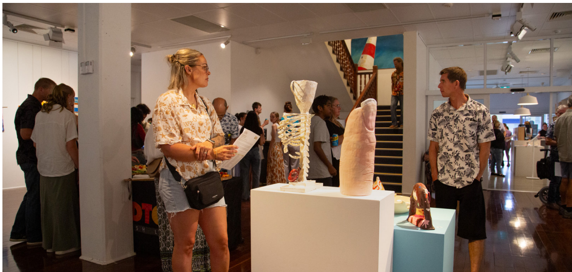
Image credit: GENESIS 2024 Opening Night at Geraldton Regional Art Gallery

GENESIS features a selection of artwork from years 7-12, showcasing our emerging Midwest artists.